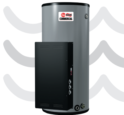
Rheem Heavy Duty 50, 85, 120 & 175-Gallon Capacities