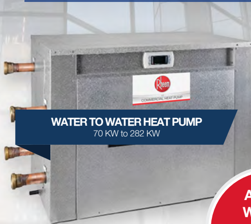
WATER TO WATER HEAT PUMP 70 KW to 282 KW