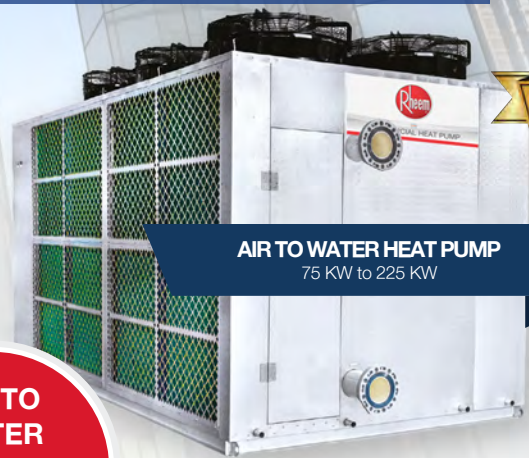
AIR TO WATER HEAT PUMP 75 KW to 225 KW